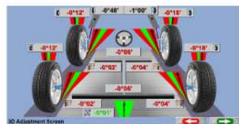
Live adjustment screen