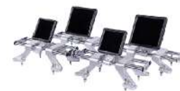
HD Targets with 24" clamps