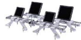
HD Targets with 24" clamps