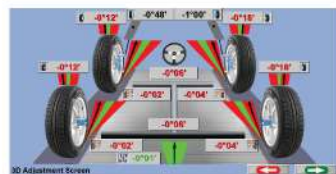
Live adjustment screen