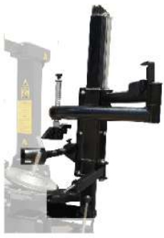
Optional HP2 Help Arm