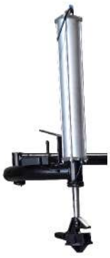
Optional ELHA Help Arm